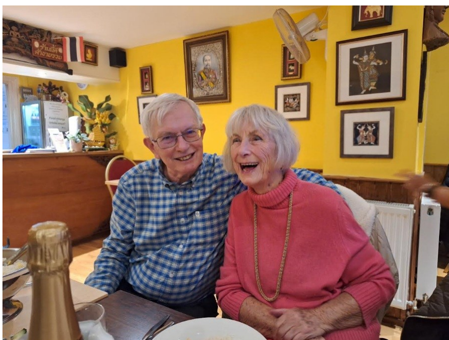
Photograph taken 18 January 2025 at the Thai Chef Restaurant, Hayle.